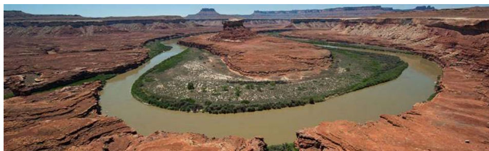
Canyonlands National Park